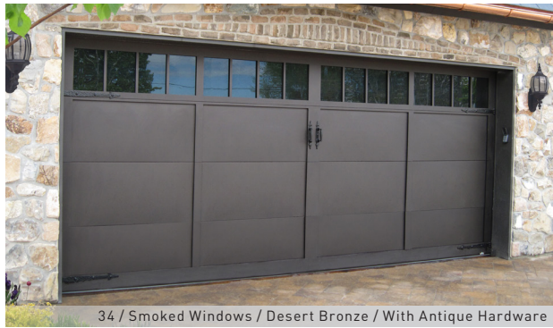
34 / Smoked Windows / Desert Bronze / With Antique Hardware