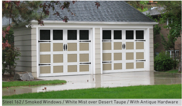
Steel 162 / Smoked Windows / White Mist over Desert Taupe / With Antique Hardware

Legend: ∞ - Lifetime Warranty† 5 - 5 Year Warranty† 3 - 3 Year Warranty† 10 - 10 Year Warranty†