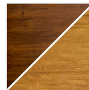
Walnut & Natural Wood Grain Steel