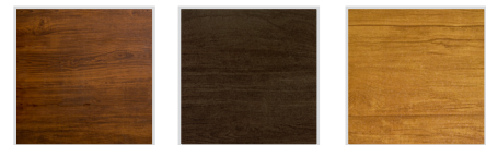
Walnut Ash Natural