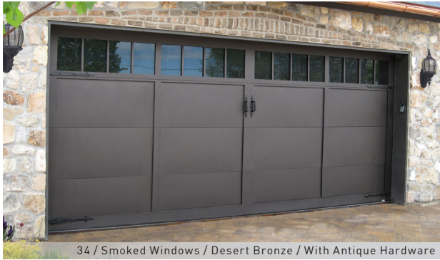
34 / Smoked Windows / Desert Bronze / With Antique Hardware