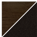
Ash Wood Grain & Desert Bronze

(See all available finishes and full list of colors online)