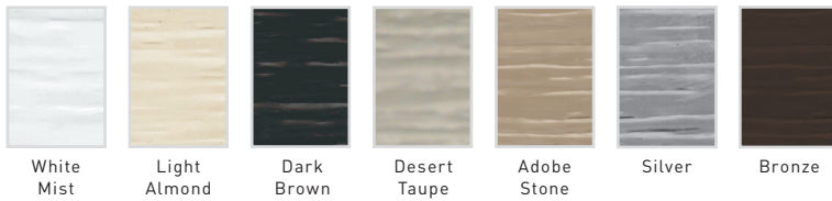
White Mist Light Almond Dark Brown Desert Taupe Adobe Stone Silver Bronze