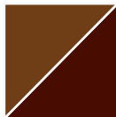
Signal Brown & Mahogany Brown